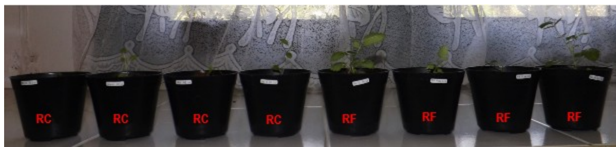
Figure 3. R. chrysophyllus (RC) and R. fraxinifolius (RF) growths on 50 days after acclimatization

our experiment, the result show that either R. chrysophyllus or R. fraxinifolius were produced less number of buds (Figure 2). Martinussen et al. [5] reported that auxins promoted root formation in vitro but inhibit shoot or bud formations.