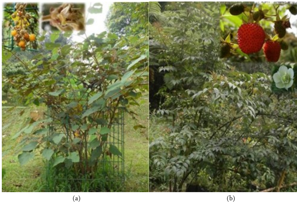
Figure 1. The plants and fruits of R. chrysophyllus (a) and R. fraxinifolius (b)