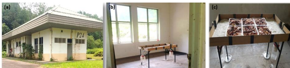
Figure 1. Photographs of the (a) location of the decomposition site, (b) placement of the harvester in the building and (c) its close-up view

Considering that insects like blowflies are poikilotherms [21, 22], their developmental patterns are largely dependent on ambient temperatures. Therefore, recording the ambient temperature and relative humidity data, as well as total daily rainfall, acquires significance for enabling suitable comparisons to be made by other researchers.