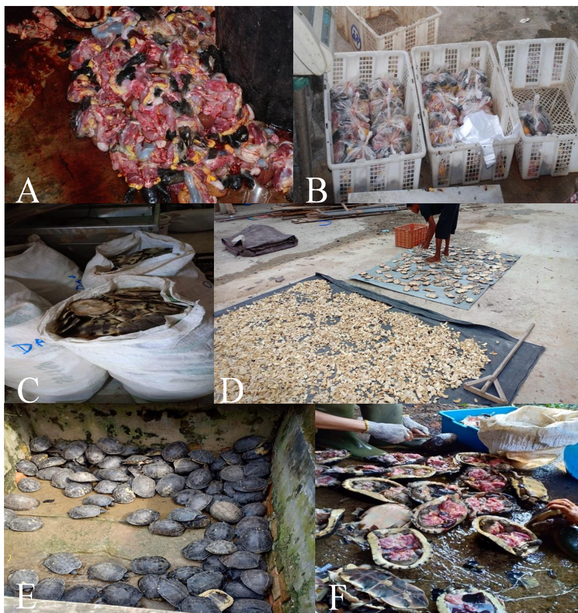
Figure 1. Turtle utilization A. The turtle meat for local consumption in Sampit, B. Packaging of turtles meat that ready to sell in local market , C. Packaging of plastron piles in the warehouse, D. Turtle shell dried in the sun, E. Pool for storing turtle in Palembang. F. Collection of carapace and plastron from the died turtle in Palembang

nant stages and some eggs in sacks that bring by hunters. This condition is hazardous for the existence of these turtle in the wild population. Supporting this, Direktorat Konservasi Keaneekaragaman Hayati (KKH - Directorate of Biodiversity Conservation) does not allow the harvesting of pregnant females. By considering the peak season and the regulation, we recommend to management authority for the socialization of limitations on the harvesting periods to avoid the preg-